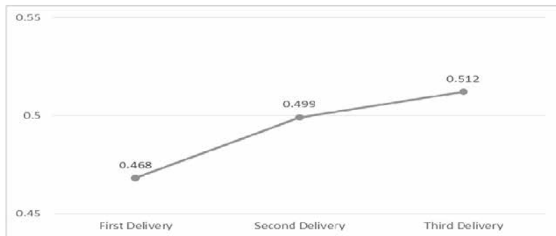
Figure 2. Error-free Clauses Rate of Deliveries.