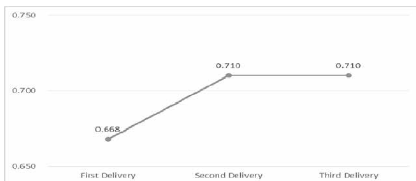
Figure 3. Correct Verb Forms Rate of Deliveries.