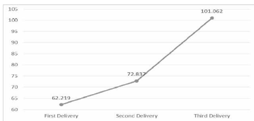
Figure 4. Words per Minute (WPM) of Deliveries.